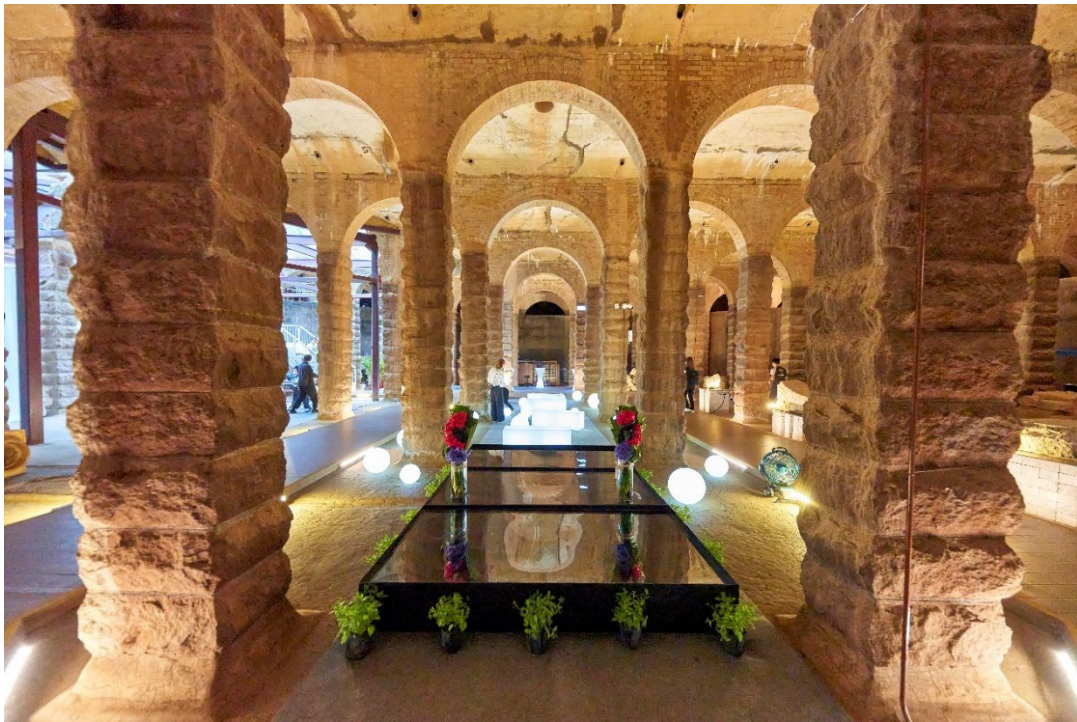
The Legacy Reflection Pool