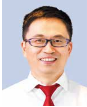
張磊先生 高瓴資本集團董事長兼首席執行官